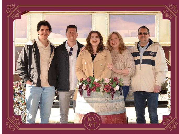
The Stumpo Family